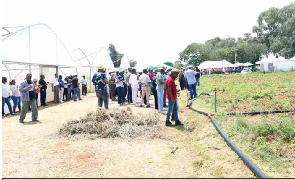
According to the QLFS, over 9000 people have lost jobs in the agricultural sector as a result of persistent load-shedding in the country.