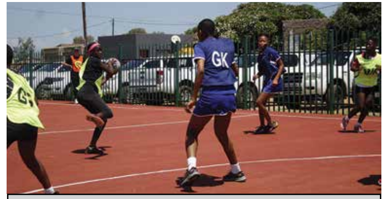
Netball sporting code was among activities that pulled attention of the audience during the JCF multi-sporting event at the Ndlovu Multi-Sporting Centre in Elandsdoorn.