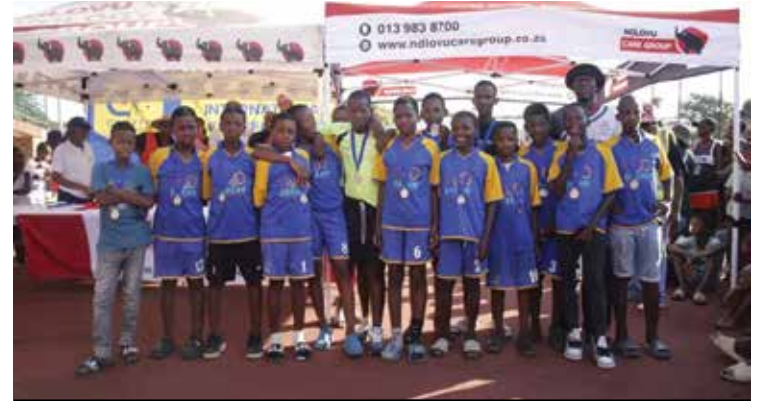
Some of the participant after receiving their prizes JCF's 20th year anniversary.