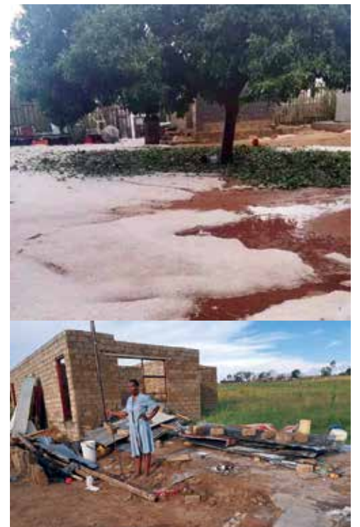
Residents of the affected villages in EMLM picking up the pieces after a violent storm ravages their homes. The heavy winds that were accompanied by hail left a trail of destruction at various villages of EMLM.