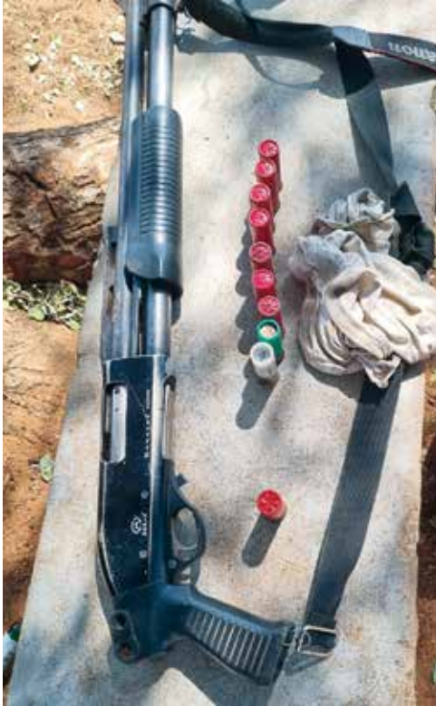
The illegal firearm and ammunition that were recovered in possession of the liquor outlet owner during his arrest at Letebejane Village.